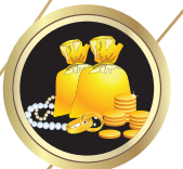
Ideal for Jewellery & Cash