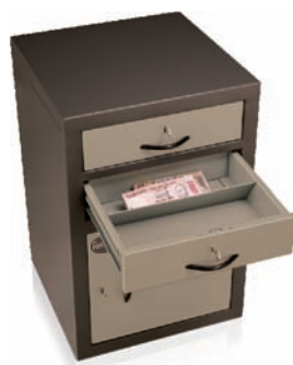
Keep the bundles in the second drawer