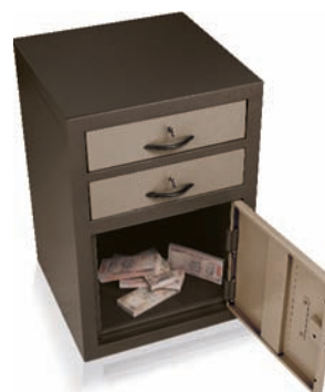
Find all the cash collected in the storage unit