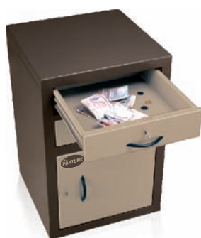
Store petty cash in your first drawer