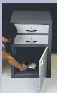
Currency Bundle automatically drops down in to the safe storage cabinet