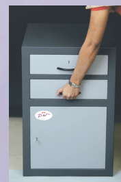
2 Drawers with snap shut mechanism