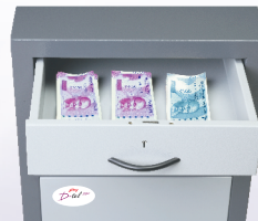
Top drawer for storing petty cash