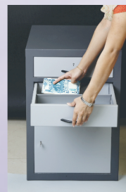
Bundle of notes being placed in depository drawer